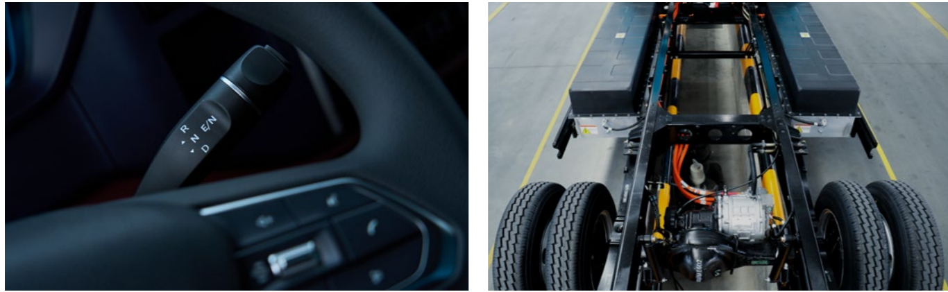
Column Shifter benchmarking Benz, drivability is similar to luxurious car The most advanced, the best configuration of the Chassis control by wire in China