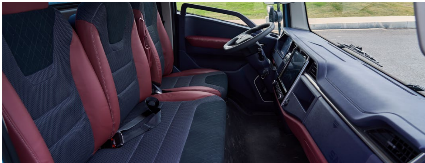
The widest "Big Sleeper" in the industry, with Non-flipping seat backs