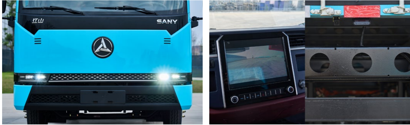
All-LED crystal headlights with outstanding appearance, energy efficiency, Reversing radar and reversing image make driving safer