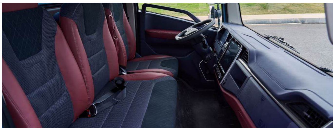
The widest "Big Sleeper" in the industry, with Non-flipping seat backs