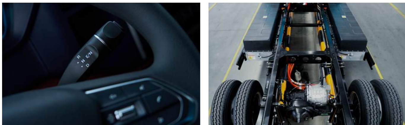
Column Shifter benchmarking Benz, drivability is similar to luxurious car The most advanced, the best configuration of the Chassis control by wire in China