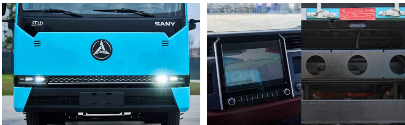
All-LED crystal headlights with outstanding appearance, energy efficiency, Reversing radar and reversing image make driving safer