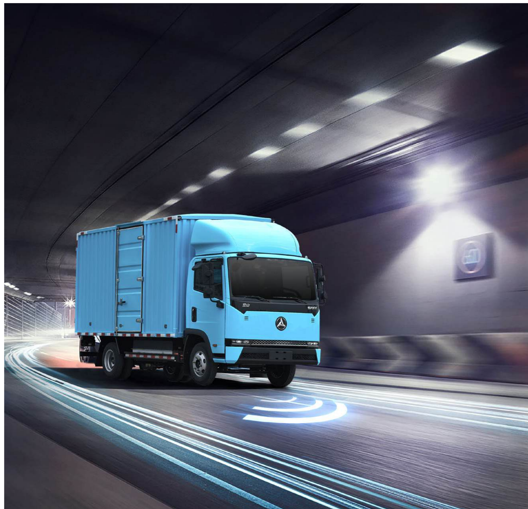
Light steering at low speed, stable steering at high speed, EPS+EHB intelligent technology